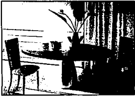
Alum extendible table By: Andrea Lucatello

Want a new look in your yard? Adventures in landscape design await at the 2001 Ann Arbor Spring Garden & Flower Show March 30-April 1 at the Washtenaw Farm Council Grounds, 5055 Ann Arbor-Saline Road in Ann Arbor. Show hours are 10 a.m.-9 p.m. Friday and Saturday, and 10 a.m.-4 p.m. Sunday. Tickets are $10 for adults, $8 for seniors and $5 for children 5-12. The grounds are located 3 miles south of I-94, exit 175.