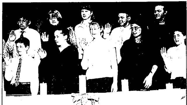
Sworn: New inductees into the Junior National Honor Society take their pledges during a ceremony held recently at East Middle School.