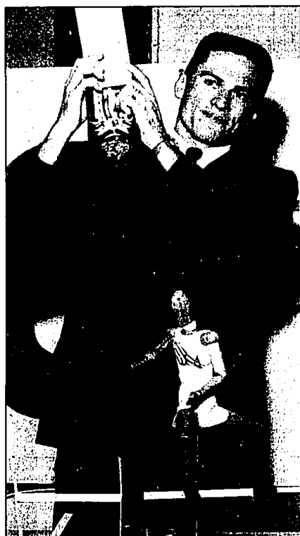
Blast from the past: In an old photograph, Rex Cawley displays the Olympic gold medal he won in 1964.