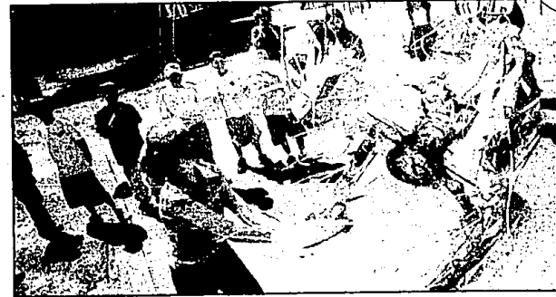
Batter up! Kathryn Wittbold connects as she swings at the pinata.