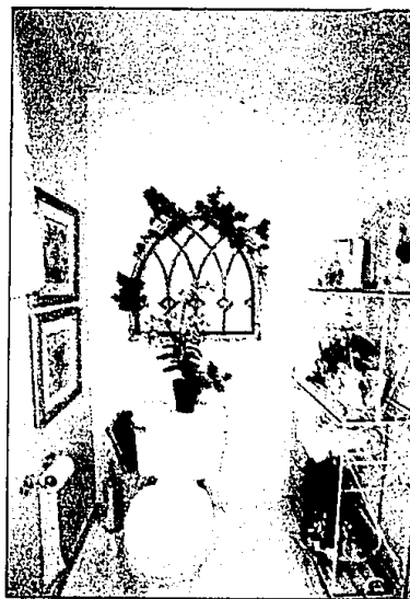
Open space: The bathroom's floor space nearly doubled in width.