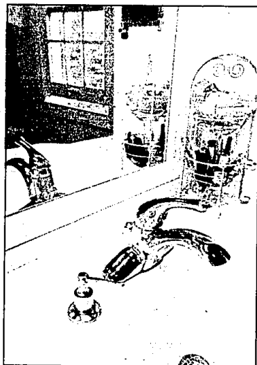
New fixtures: The renovated bathroom features a double sink and shower from Marble-Lite. The old bathroom (the two photos at right) wasn't in bad shape, it just was too narrow for the Nimmerguths.

Write up a short summary describing the project and submit it to Ken Abramczyk, At Home Edition, 36251 Schoolcraft, Livonia, MI 48150 or e-mail kabramczyk@oe.homecomm.net. If you have "before" and/or "after" photos, please include them as well.