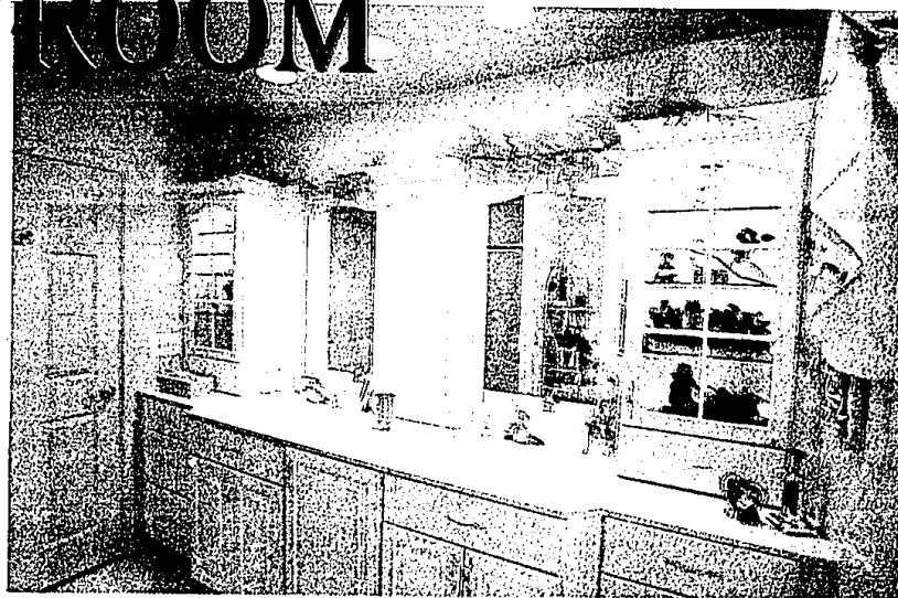
Brighter days: Lights and off-white accents brighten up displays of burgundy dried flowers, oil bottles and perfume bottles. The bathroom features a double sink, a hamper with sliding racks and two sets of outlets.