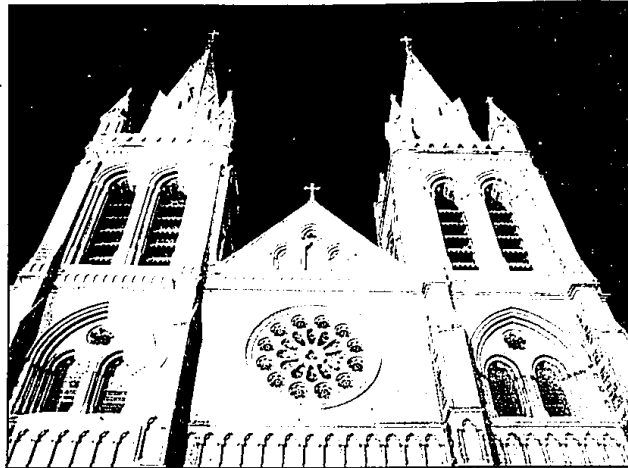
Awesome In Australia: Mickey Nagler made this dramatic nighttime photograph in Adelaide, Australia. It's St. Peter's Cathedral, and an exposure of 1/4 second at f/4 worked just fine.