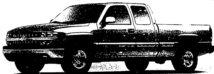
2001 CHEVY SILVERADO® 1/2-TON 2WD EXT. CAB SHORT BOX