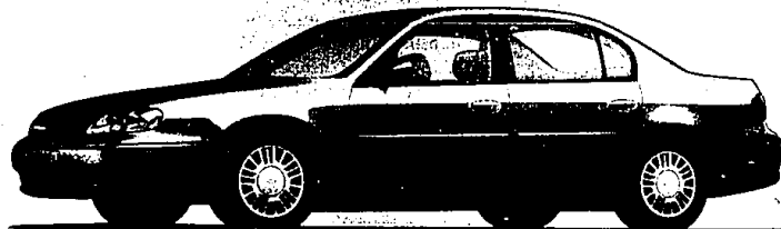
2001 CHEVY MALIBU®

Payments include available Factory-to-Dealer Cash.