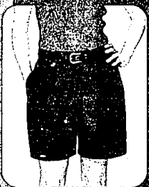
sale 14.99 Large selection of ladies' shorts and skirts. Reg. 34.00. IN LADIES' SPORTSWEAR