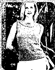
sale 19.99 Large selection of famous-maker sleeveless tops. Reg. 28.00-34.00. IN CASUALWEAR