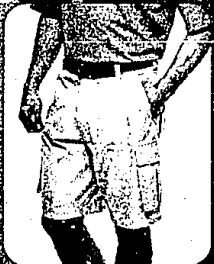
sale 14.99 Famous-maker shorts in carpenter and cargo styles. Reg. 30.00-34.00. IN MEN'S