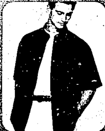
50% off Large selection of men's shirts and shorts. Reg. 25.00-45.00. sale 12.50-22.50. IN MEN'S