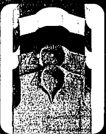
sale 17.99 Entire stock of sleeveless sweaters from relatively. Reg. 28.00-34.00. IN LADIES' SPORTSWEAR. SELECTION MAY VARY BY STORE.