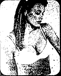
sale 15.99 Entire stock of bras from Warner's, Maidenform, Olga and Lily of France. Reg. 24.00-29.00. IN INTIMATE APPAREL