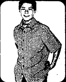
extra 30% off Already reduced shorts and tops in boys' sizes 2-20 and girls' sizes 2-16 from Parisian Kids and PK Clothing. Orig. 16.00-24.00. sale 9.99-12.99. now 5.99-9.09. IN CHILDREN'S

instant credit Five minutes is all it takes to open a Parisian credit card. See an associate for details.