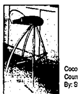
Coco stool Counter or bar height By: Studio Kronos