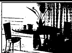
Alum extendible table By: Andrea Lucatello