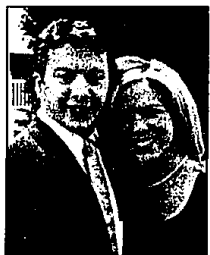
A summer 2002 wedding is planned in Chicago.