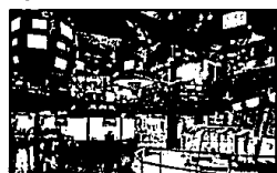
Family fun: At Great Lakes Crossing, which won best mall for the family, kids can play at Gameworks while their parents shop.

But, hey, isn't a great bargain an experience in itself?