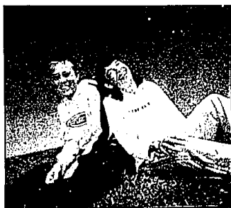
School wear: Hooded fleece tops and track pants scream cool comfort, $26-28 at Meryyn's stores.