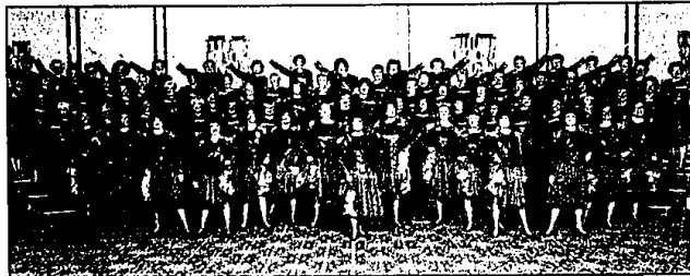
Singing lessons: The Spirit of Detroit Chorus gives a series of singing lessons on Tuesdays and Thursdays at St. Paul's Presbyterian Church in Livonia.

The exhibition features 103 works in a variety of media. Hours are 10 a.m. to 5 p.m. Monday, Wednesday and Saturday, until 3 p.m. Friday, until 8 p.m. Tuesday and Thursday, and noon to 5 p.m. Sunday.