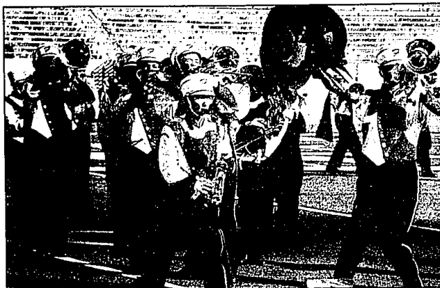
Holiday on turf: The Farmington High School marching band played a medley of holiday music during the Michigan Invitational earning a fourth place finish with their "Holiday Spectacular."