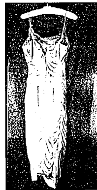
Out of the closet: Artist Claudia Shepard began this figurative series based on the Edward Muybridge motion studies of the late 1800s. Unzipped is one of the paintings on display through Dec. 1.

The Print Gallery is located at 29173 Northwestern Hwy., Franklin Plaza at 12 Mile Road. For information call (248) 358-5454.