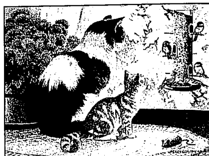
Nature: This card benefits the Michigan Animal Rescue League.