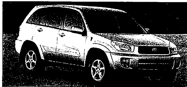
It's a winner: 2002 Toyota RAV4 Vehicle class: Sport utility. Power: 2.0 liter 4-cylinder engine. Mileage: 23 city/27 highway. Where built: Toyota City, Japan. Base price: $18,975. As tested: $26,420

Let's talk about the comfort. I drove it all over the Detroit area, from east to west, to southern