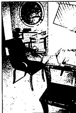
At High Point: Woven leather, as in these pieces by DLA, is popular. The items were shown at the International Home Furnishings Market in High Point, N.C., in October.

Many features of 2002 trends are in the project, which was completed earlier