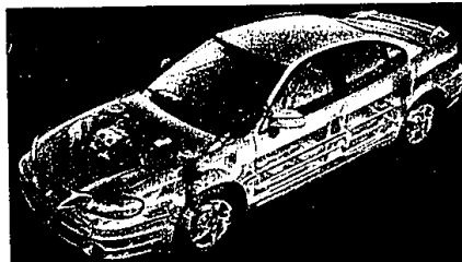
How Grand: Pontiac's Grand Am offers more fuel efficiency with a new 2.2-liter dual overhead cam four-cylinder engine; and twin balance shafts, all-aluminum construction and structural rigidity for noise, vibration and harshness control.

A number of one-optional features will become standard on all models in 2002, such as tilt