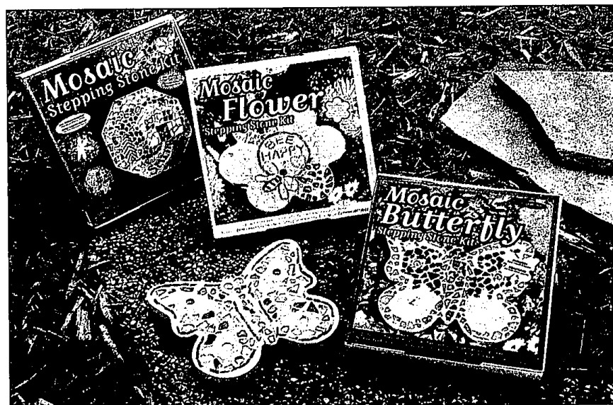
Self-made: Do-it-yourself stepping stone kits (above) allows the gardener to choose whatever poetic word would best suit their garden style. Mosaic and gem stepping stone kits (top, left) are also available at Frank's Nursery & Crafts.

And expected to be big again this year are stepping stones. Sure there's the current favorites of stone or resin butterflies, dragonflies, turtles and frogs — but look beyond those mainstays and catch some even more unique ideas.