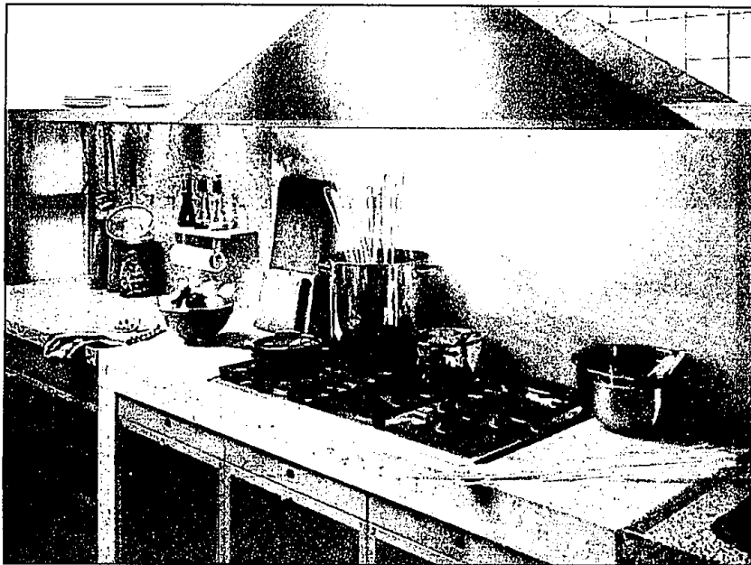
Stylish Ideas: From ovens to wine storage, Trevarrow Inc. will display its most interesting ideas at the show — including the gas cooktop pictured here and warming drawers.

Popular floorings will be on exhibit too, Dillard said. Sales of laminates, like Pergo-brand, have soared because it can be installed by the homeowner and is very durable.