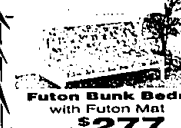
Futon Bunk Bed with Futon Mat Starting at $277 take with

Grand Rapids Bedding Co. THE MATTRESS SUPERSTORE TROY WAREHOUSE CLEARANCE CENTER 32301 Stephenson Hwy. (Across from Wal-Mart just off I-475) 1-800-668-MATS WEST BLOOMFIELD 66900 Orchard Lake Rd. (West Bloomfield Plaza) 1-800-579-MATS WATERFORD CLEARANCE CENTER 48322 Clinton Hwy. (Next to Clevor's Car Wash at Wal-Mart) 1-800-929-MATS ROYAL OAK 32222 Woodward (Next to Bob's Pizza 1/2 mile S of I-475) 1-800-339-MATS