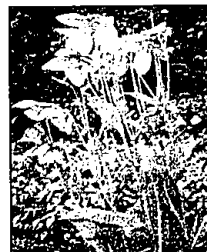
Blue poppy: The blue poppy, Meconopsis , is native to the Himalaya, here growing in Saville Gardens in England.

Marty Figley is an advanced master gardener based in Birmingham. You can leave her a message by dialing (734) 953-2047 on a touch-tone phone. Her fax number is (248) 644-1314.