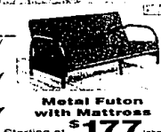
Metal Futon with Mattress Starting at $177 take with