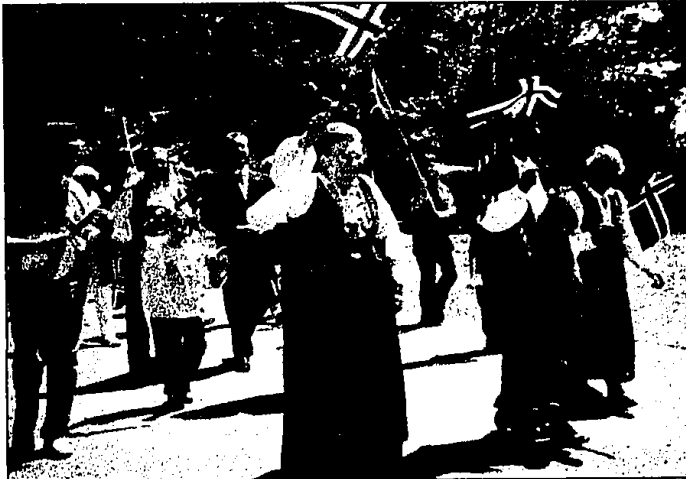
Parade: Members of the Sons of Norway's Nordkap Lodge, dressed in national costumes, participate in a Norwegian Constitution Day parade.

Even if you're not Norwegian, you can join the fun and celebrate Norwegian Constitution Day 11 a.m. to 3 p.m. Saturday, May 18 at the Swedish Club, 22388 Ruth St. in Farmington Hills.