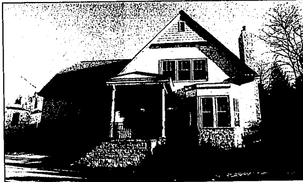
Birmingham delight: Custom homes designed by Victor Siroki and built by Brody Homes and BRG Custom Homes provide luxury living at Riverside.

Monied people who want one luxurious home, a beautiful topography and the Birmingham's ZIP code with all of its amenities will love Riverside, the builders and developer there agree. Only two spec homes and three lots are still available in the small, single-family condominium community just west of Southfield Road just south of Brown Street near downtown. One spec - about 4,000 square feet - carries a listing price of $1.65 million. The other, about 3,800 square feet and not quite finished, lists for just under $1.7 million. Two other homes under construction there, as well as a partial demolition and refurbishing of an historic farmhouse, have owners. BRG Custom Homes and Brody Homes are collaborating here as they did in Dourdan Park in Bloomfield Hills. They're building on an alternating basis plans designed by architect Victor Siroki. "A home like this is an indulgence," said Louis M. Beaudet of BRG. "We plan on indulging with amenities and luxury." "Our role as the builder is to take architectural design, interact with the (interior) designers they (buyers) select and bring to reality their dream home with quality and craftsmanship," said Gerald Brody. "This is lifestyle here," Beaudet added. "This is a turnkey development."