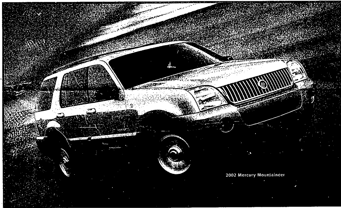
2002 Mercury Mountaineer

Memorial contributions may be made to Arbor Hospice.