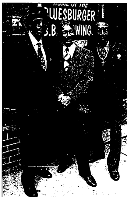
Greektown Art Fair: Motor City Rhythm and Blues Pioneers will entertain on Sunday.