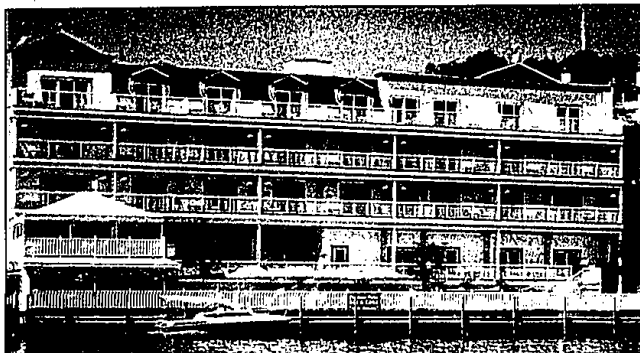
Summer destination: Newly remodeled, the Chippewa Hotel has been serving guests for 100 years on Mackinac Island.