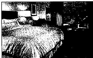
First class seat: When The Westin Detroit Metropolitan Airport hotel opens in November, guests in The King model guest room, seen here, can overlook the airport's tarmac. Guests can also see planes take off and land from the planned jet ramp observation lounge.