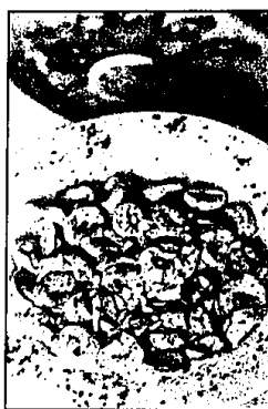
Specialties: Maria's Front Room dishes Spinach Tortellini, front, and Veal Scaloppini Ala Mare, rear.