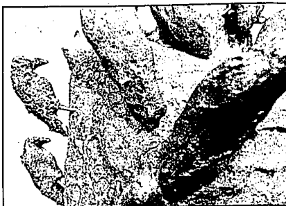
Under attack: Dozens of birds peck at a larger than life figure in the "Gathering of Crows," an autobiographical sculpture by Mark Chatterley.

Chatterley leaves it to others to tell about the work in the collections of the Holocaust Museum in Florida, Kresge Art Museum, Lansing, and the Plymouth Community Arts Council. The sculpture, gracing the front of