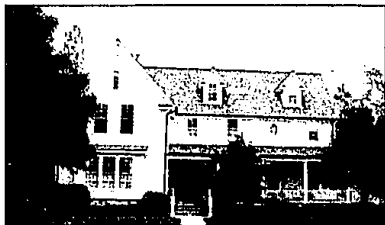
366 Greenwood S. off Harmon & W. of Woodward