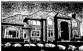
Oakmont of Clarkston: This colonial of 4,200 square feet constructed by Adrian Building features four bedrooms, three full baths and two half baths.

"They love the floor plan," Sulejman said. "Base price of the homes built by Adrian at Oakmont ranges from $494,900 for a colonial of 3,000 square feet with