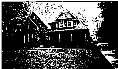
All Sports Commerce Lake Canal Front Home

Competence, Integrity and Personalized Attention 443 S. Old Woodward Avenue, Birmingham, Michigan 48009