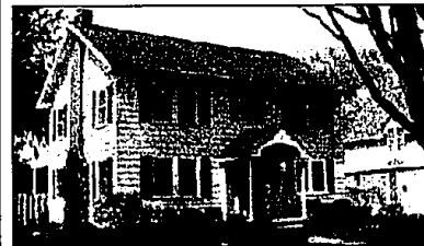
Quarton Lake Charmer 859 Lakeview South of Oak, West of Old Woodward