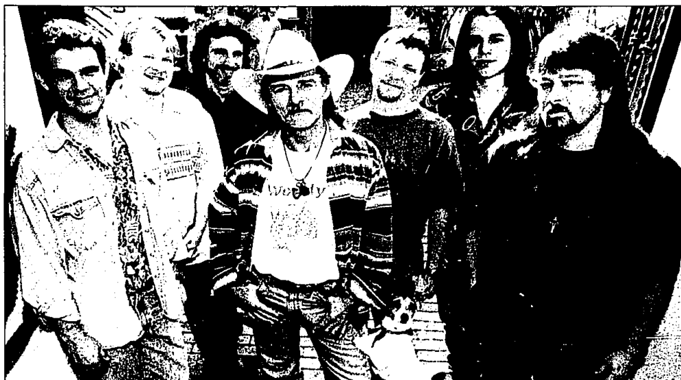
Let's Get Together: Dickey Betts & Great Southern perform 8 p.m. Saturday, June 15, at the Magic Bag, 22920 Woodward, Ferndale. Tickets are $23 in advance. Call (248) 544-3030. One of the founding members of the Allman Brothers Band, Betts & Great Southern play tunes from their CD Let's Get Together .

Art in the Woods: 10 a.m. to 5 p.m. Saturday, June 19, and 11 a.m. to 5 p.m. Sunday, June 30, the 10th annual juried art and fine