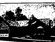
Pontiac delight: Only ranch homes, all with sunroom options, are available at Fieldstone Village.

All of the homes contain at base price a two-car garage, first-floor laundry, basement with a poured concrete brick pattern, energy-efficient furnace and water heater,