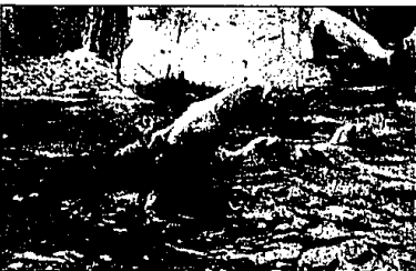
Seals and sea lions entertain at Six Flags Worlds of Adventure.