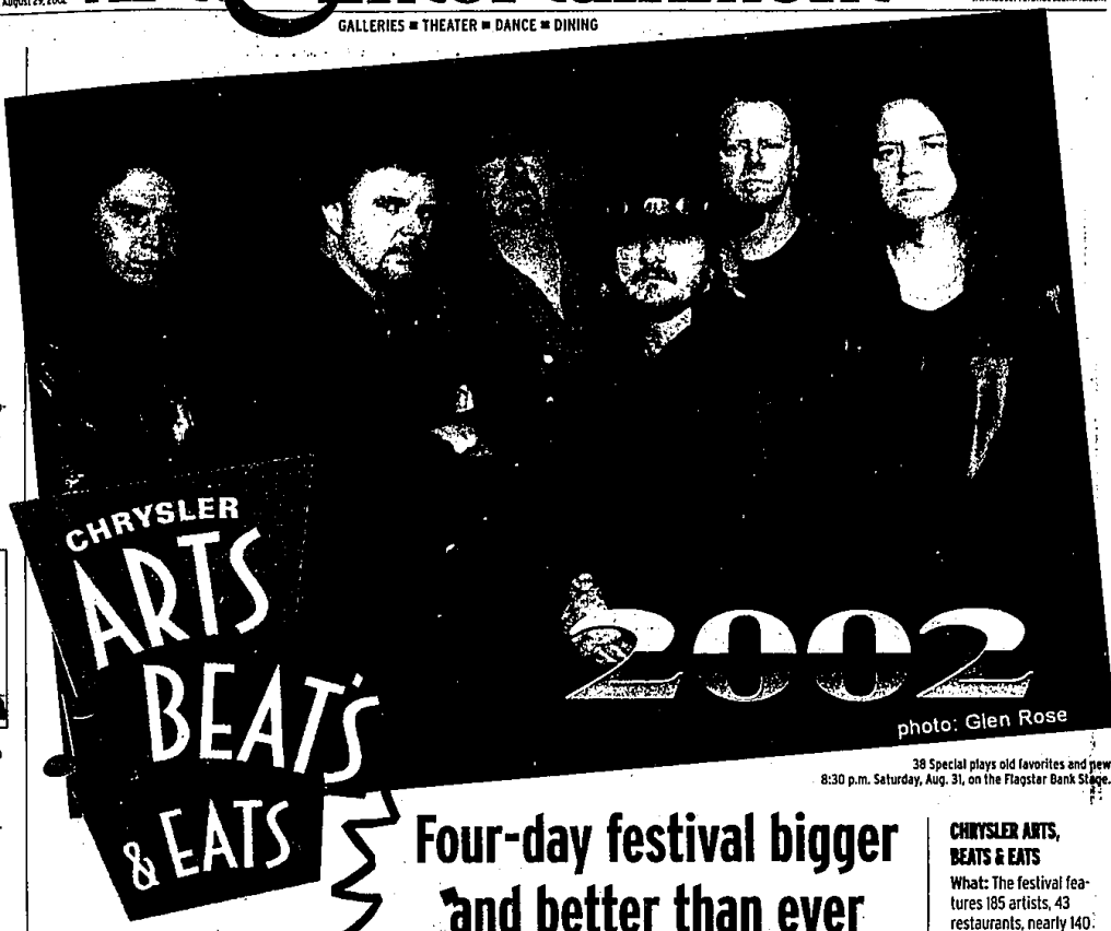
38 Special plays old favorites and new 8:30 p.m. Saturday, Aug. 31, on the Flagstar Bank Stage.

Visitors also will find ethnic food booths, a petting zoo, puppet shows, storytellers, a classic car cruise, a parade (1 p.m. Monday, Sept. 2) and polka bands. The action takes place in the heart of the city, on Joseph Campau between Caniff and Carpenter.