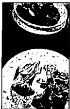
George & Harry's is the vision of name-sakes