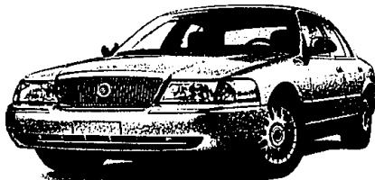
2003 MERCURY GRAND MARQUIS GS