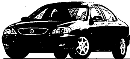
2002 MERCURY SABLE LS PREMIUM

You can get it all at your Mercury Dealer. Our Mercury Sable LS Premium comes with leather-trimmed seats and ABS, $1,495 in extras, at no extra charge. Mercury Mountaineer's standard third-row seat helps seat seven, then folds down to give you up to 81.3 cubic feet of cargo space. And inch for inch, pound for pound, the newly re-designed Mercury Grand Marquis is the best value in its class.* We've got it. So come and get it at your Metro Detroit Lincoln Mercury Dealer.