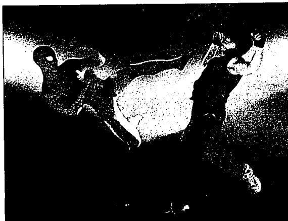
Powl Crash! Spiderman fights a bad guy in Spiderman Live! The action-filled show comes to The Masonic Temple on Tuesday, Nov. 12.