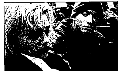
Brittany Murphy and Eminem star in 8 Mile . The movie, which was filmed in Detroit, opened Friday.