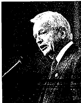
U.S. Representative Joe Knollenberg made a surprise visit to the 'Stars & Stripes Forever' luncheon.