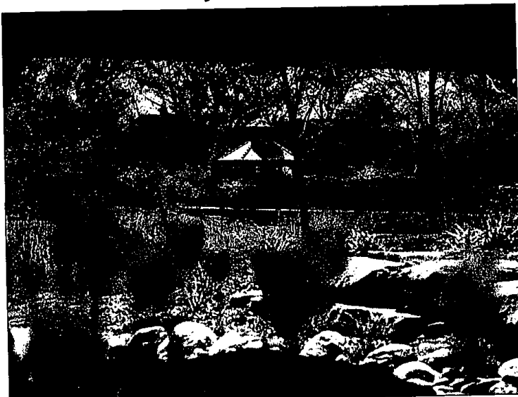
Boardwalks provide a view of delightful natural features at The Oaklands.

"Our goal was to provide a vacation-type atmosphere," said Herb Lawson, CEO with Windham. "We reclaimed a creek, restored it, restocked it with trout.