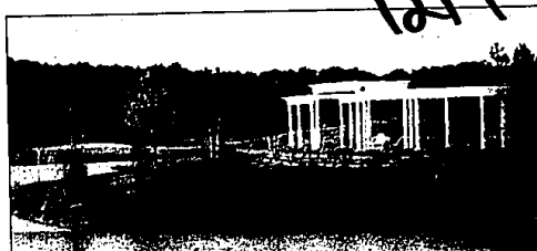
Water is a very big component in the Stonewater development.

"Each partner has decades of experience, and we combined construction, marketing and environmental standards," Mocer added.