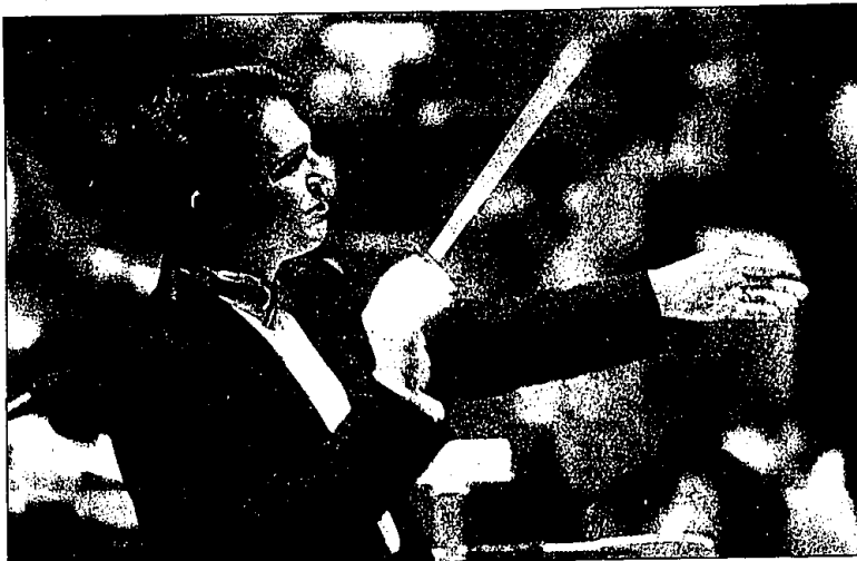
Keith Lockhart conducts the Boston Pops Esplanade Orchestra in a holiday concert that's part of the University Musical Society series in Ann Arbor.

prologue from Vaughan Williams' Hodie and The Adoration of the Magi from Respighi's Three Botticelli Pictures help keep it new when performing audience favorites