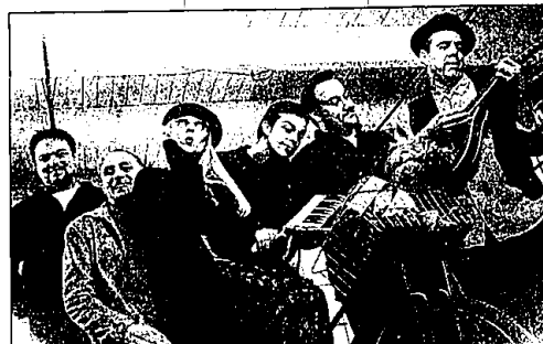
Check out the "FolkRockoustic" sounds of Tangerine Trousers when it performs at 8 p.m. Saturday, Dec. 7 at Trinity House Theatre, 38840 West Six Mile, Livonia. The Trousers have developed a unique sound by combining the elements of folk, blues, country, jazz, pop, rock, gospel and even African music. Special guests, The Blue J's, also will perform their acoustic music. Tickets are $10 general admission and $7 for theatre members. Reserve tickets by calling the theater at (734) 464-6302.

The 16-acre museum complex tells the story of Oakland County's earliest pioneers. Admission includes tours of the 1840 Van Hoesen Farmhouse, 1850 Tenant Red House and 1927 Van Hoesen Dairy Barn. The museum's new permanent exhibit, A Lively Town, uses more than 200 images and 100 artifacts to show the development of the Rochester area. $5, $3 children, students and seniors. Hours are 1-4 p.m. Wednesday-Saturday, at the museum on Van Hoesen Road, one mile east of Rochester Road off Henken, (248) 645-4663 or visit the Web site at www.rochesterhills.org/museum.htm