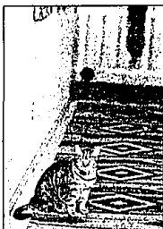
A family cat pauses on one of the brightly colored rugs in the house.

An upstairs guest room is called the "cowboy room." Around the perimeter runs a variation of a Willie Nelson song: "Mamas let your babies grow up to be cowboys." Large planks cover the walls. The chandelier is made of antlers. The bed resembles rough-hewn logs, and features a bedspread with a pattern of cowboy boots and a horse blanket made by Reinholm's sister at the foot. Horse and cowboy motifs abound at the house - from the horse-shaped shrubbery in the front yard, to little touches such as a horse-shaped switchplate and a camel saddle that serves as a footstool. A horse form that was a prop at an old Hudson's store stands in the corner of one room (the couple named it Hudson). In another room is a metal horse