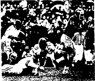
Gets a Block ...