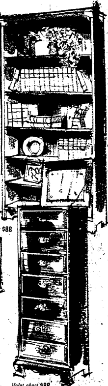
Valet chest $88