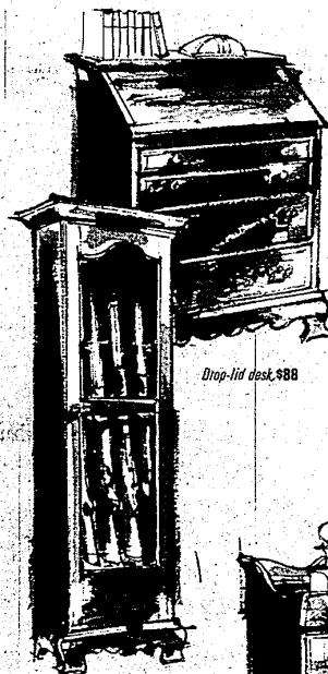
Drop-lid desk $88