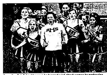
Comedian Rob Schneider says he learned a lot about women by portraying one, in his new comedy, The Hot Chick .