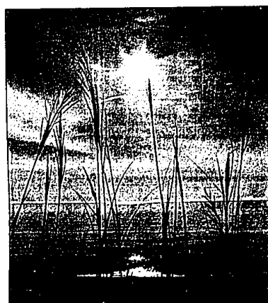
The sun itself becomes the subject in Monte Nagler's photograph taken in South Haven. He was careful to avoid looking directly at the sun.

But how about deliberately allowing some lens flare in order to add an unusual and exciting effect to your picture? In doing so, the flare, or light itself, becomes your