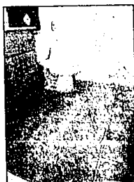
Ceramic Tile and Marble Co. in Garden City replaced Pam Pierson's ailing flooring with sandstone ceramic tile, a perfect complement to the bathroom's oak cabinetry.