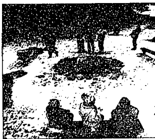
With cold temperatures and brisk wind, the warming fire was a popular place.

Farmington Hills Recreation Department hosted about 200 people at Heritage Park Sunday, for their first Winterfest. Guests enjoyed cross-country skiing lessons, arts and crafts, a hardest shot contest sponsored by the Farmington Hills Hockey Association, bean bag toss game with the department's mascot, Parkey, and sledding. East Mountain Sports sponsored a snowshoe demonstration. The afternoon's menu included a hot dog and marshmallow roast, as well as a little hot cocoa and playoff football.