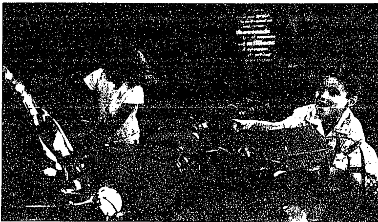
Learn how a synapse makes the connection between neurons, the brain's electrical relay system, at the museum's Brain exhibit.