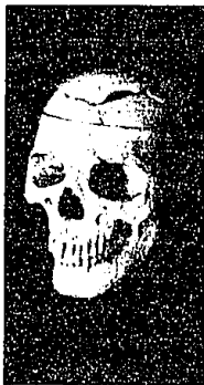
Displays in the museum's Brain exhibit feature such items as a re-creation of the skull of Phineas Gage, a man whose brain was pierced by a metal rod.

Throughout the exhibit, visitors will learn amazing facts or "Brain Bytes," including: ■ There are as many neurons in the brain as there are stars in