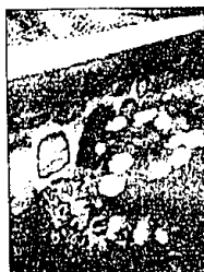
White coreopsis is easily started from seed.

"Click the seed packets to see if the seeds need light to germinate. If so, press them lightly into the surface. If they require darkness, cover with a 1/2-inch of mix or vermiculite and tamp it down. Mist the